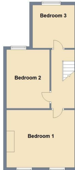
First Floor Approx. 40.0 sq. metres (430.8 sq. feet)