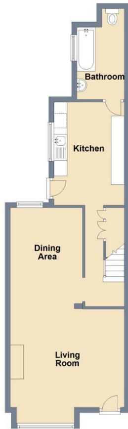
Ground Floor Approx. 50.8 sq. metres (546.3 sq. feet)